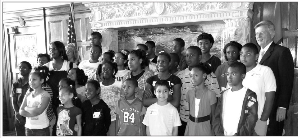
Some of the more than 100 youth attending the CFC Youth Lobby Day have their picture taken with Gov. Beebe.

Support the DREAM Act - Ensure that all Arkansas high school graduates have the opportunity to pay in-state tuition rates at Arkansas colleges: