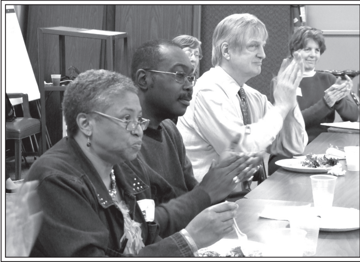
Leaders from across Arkansas attended the 5 CFC Lobby Days to talk with their legislators about the issues.